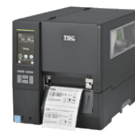
MH Series Performance Industrial Printers