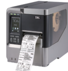
MX Series Performance Industrial Printers