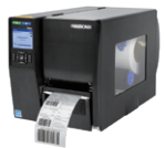
T6000e/T6000e RFID Series Enterprise-grade Mid-Level Industrial Printers