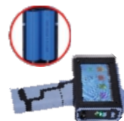
Detachable battery and up to 16 hours ultra long working

One printer for dual use. Take in hand for mobile coding and mount on production line for auto coding.