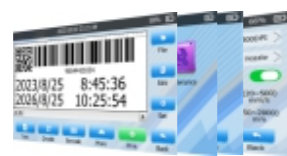
Optimized user interface, easy operation

Compact design, the whole machine weighs only 430g. Ultra flexible and smooth coding with built-in encoder design.