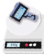
Lightweight and Compact size

Compact design, the whole machine weighs only 430g. Ultra flexible and smooth coding with built-in encoder design.