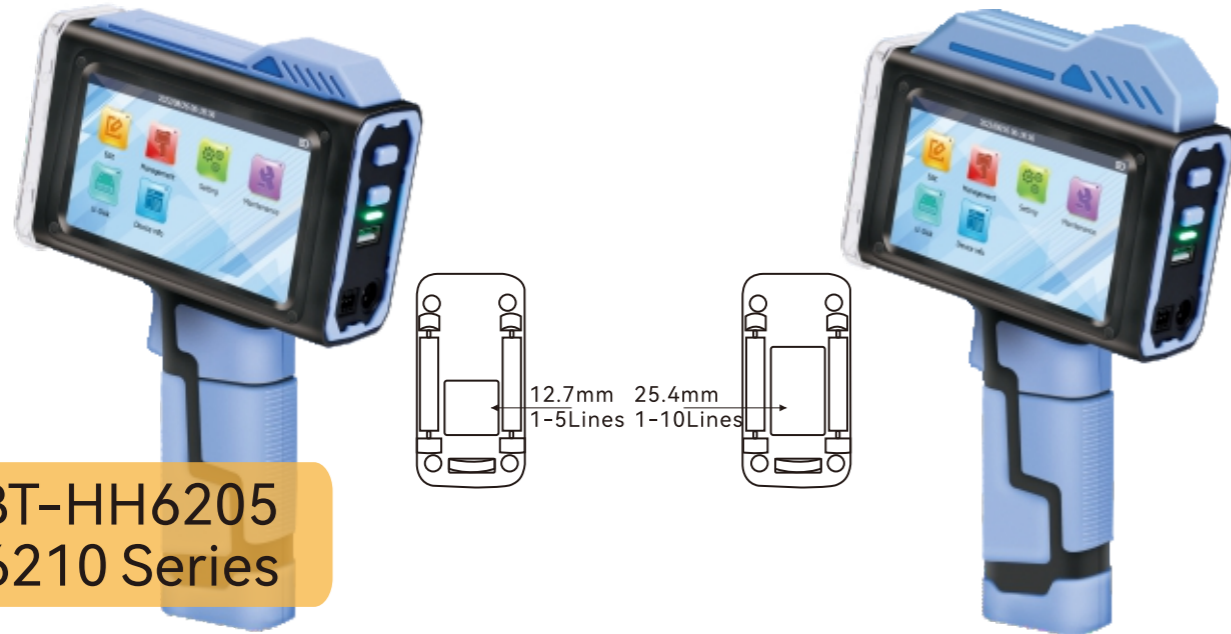
BT-HH6205 /6210 Series